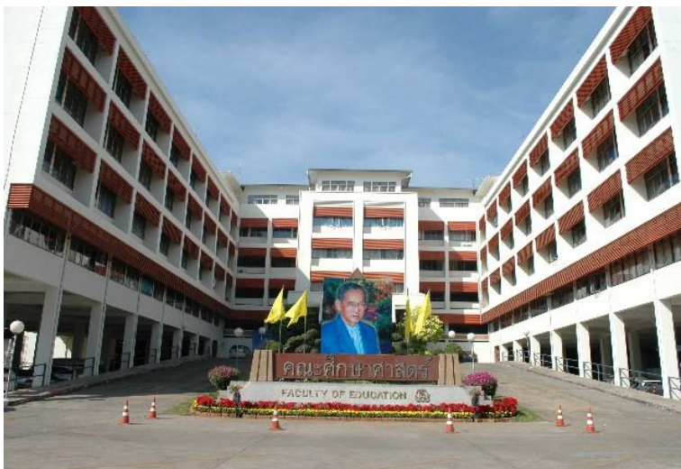
Faculty of Education