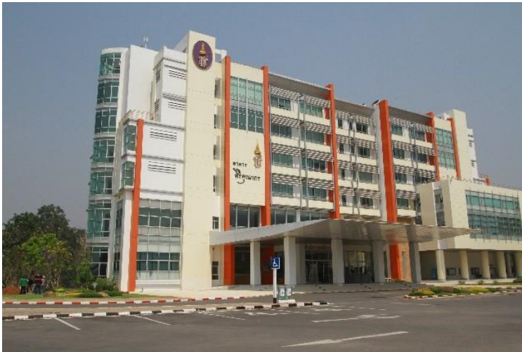
KKU President Building