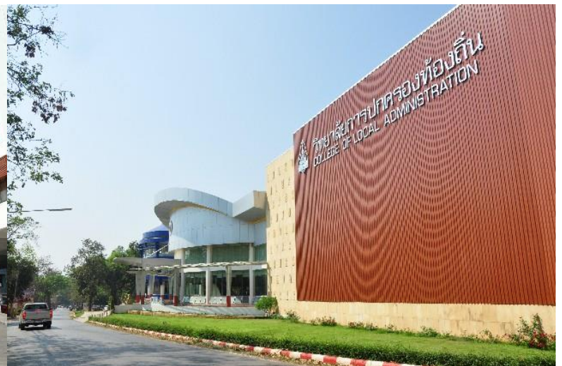
College of Local Administration