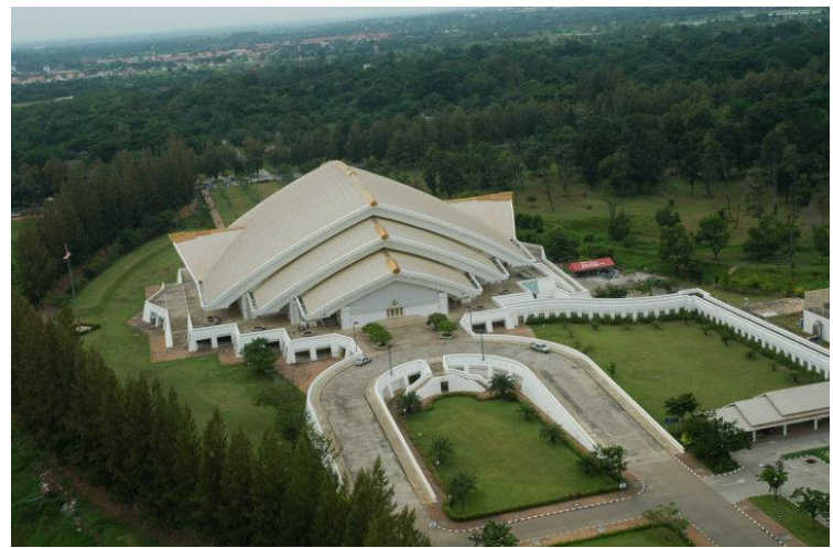
Golden Jubilee Convention Hall