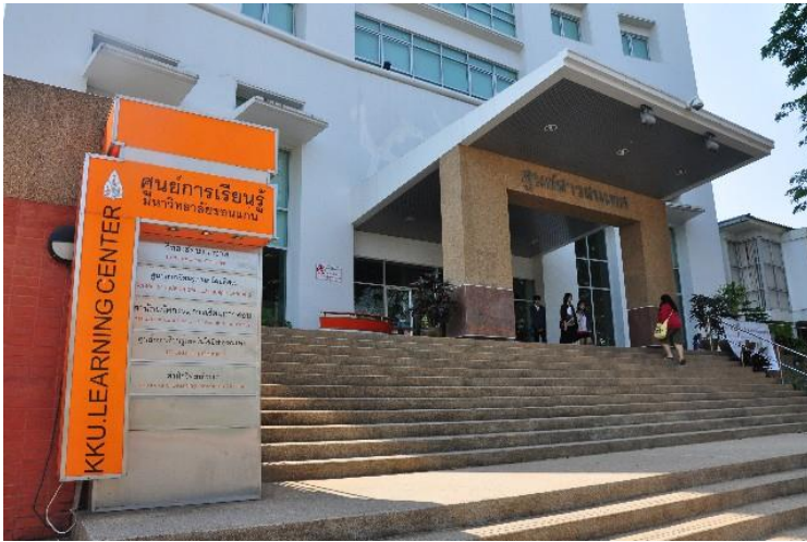
The Learning Center