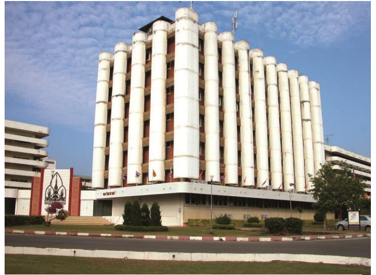
Faculty of Science