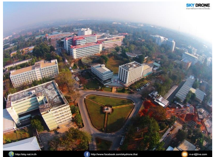
A part of KKU view by Sky Drone