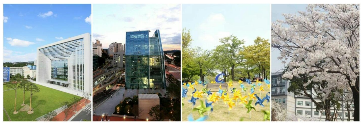
Gachon University (Global campus)

in different laboratories such as Molecular Laboratory, Biochemical Laboratory, and Stem cell Laboratory. These accumulate experience and laboratory skills are extremely meaningful for him for studying Korea