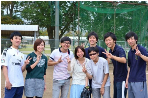
Attending Welcom party and basketball competition with international students