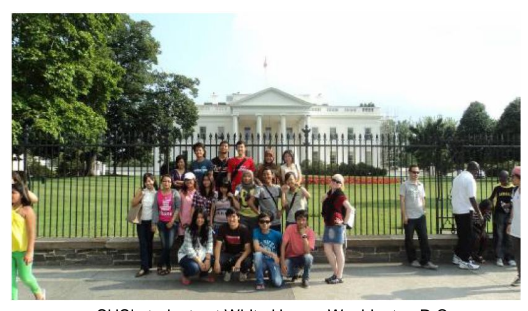
SUSI students at White House, Washington D.C

Besides, I joined several field trips such as volunteer at Food Bank, PEAS Farm, and waste dispose at Milton Dam. I also took short training of camping for environment protect, contact with students majored in Environment at UM. Apart from that, I participated in a lot of recreational activities including rafting, hiking, rope course, climbing wall and horse riding. I also had an interesting trip to discover the ecology and climate change within 4 days at Glacier National Park, one of the most famous national parks of the USA, is popularly known as Crown of the Continent.