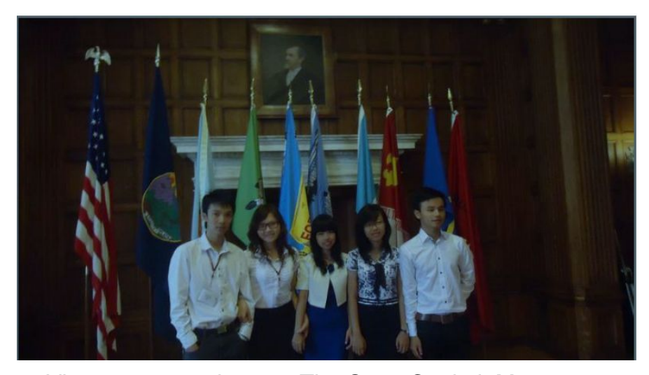
Vietnamese students at The State Capitol, Montana

Five weeks of joining Study of the United State Institute for Student Leaders on Global Environment Issues (SUSI)" are full of memorable moments. This program sponsored by USA Department of Foreign Affairs is for 3<sup>rd</sup> -4<sup>th</sup> year university students. Participants of this program are 19 students coming from 4 countries Vietnam, Laos, Cambodia and Indonesia (5 are Vietnamese).