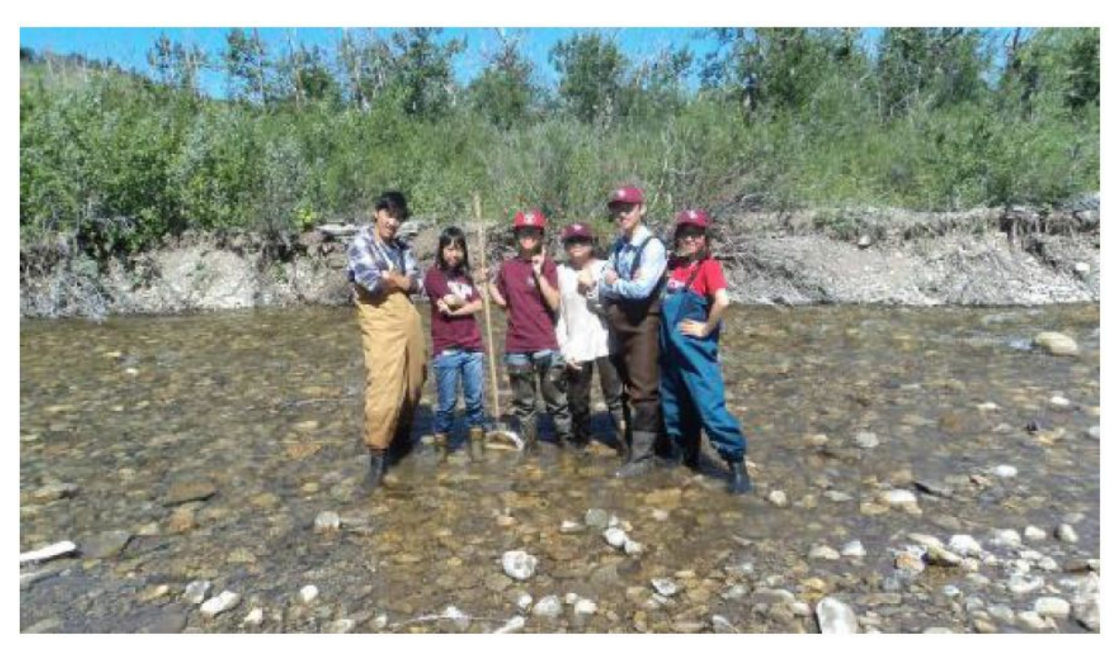
At a field trip to measure the flow velocity

After this program, I have broadened my knowledge, made a lot of new friends and learnt life skills. These facts motivate me and other participants finalize our projects in order to contribute to our hometown as well as the state.