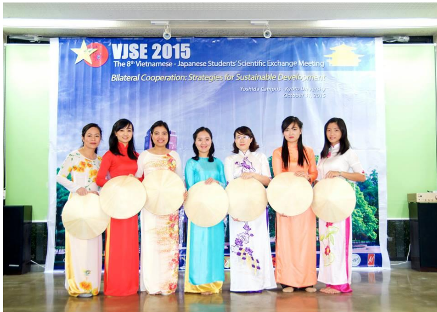
Fig. Vietnamese - Japanese students' scientific Exchange Meeting

At the laboratory, My experiment was isolation bacteriophages which infect Ralstonia solanacearum . Also, Uyen took part in reports, academic activities and exchange of research results which were organized by Professor weekly.