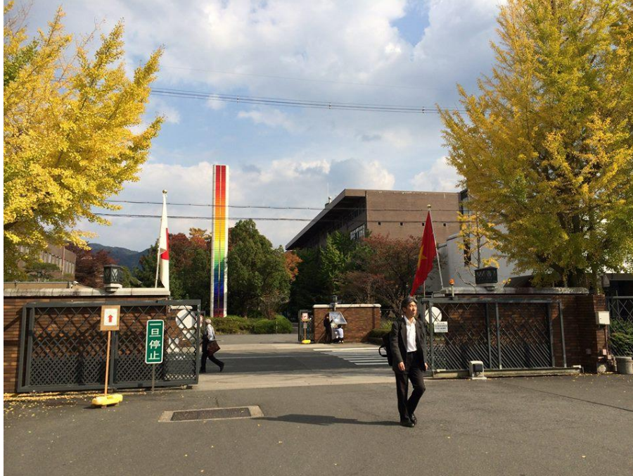
Fig. A corner of KIT

At the laboratory, My experiment was isolation bacteriophages which infect Ralstonia solanacearum . Also, Uyen took part in reports, academic activities and exchange of research results which were organized by Professor weekly.