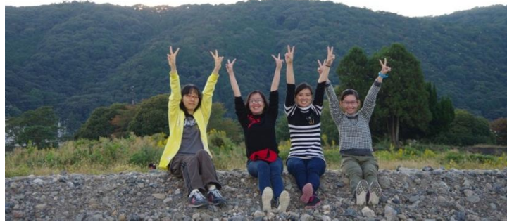
Fig. Picnic with all members in labotary