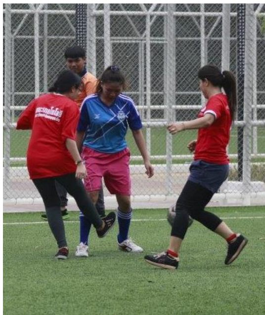
Playing volleyball and football

Moreover, I had chance to visit some of famous places in Thailand such as Nong Khai, Chiangrai and also Northeastern mountain of Thailand. As taking part in these trips, not only did I study much about language, culture and special foods of Thailand, but also I had more time to do social activities for supporting children and poor people living in mountain. Moreover, trips gave great opportunities for me to make friends and practice my English speaking skill.