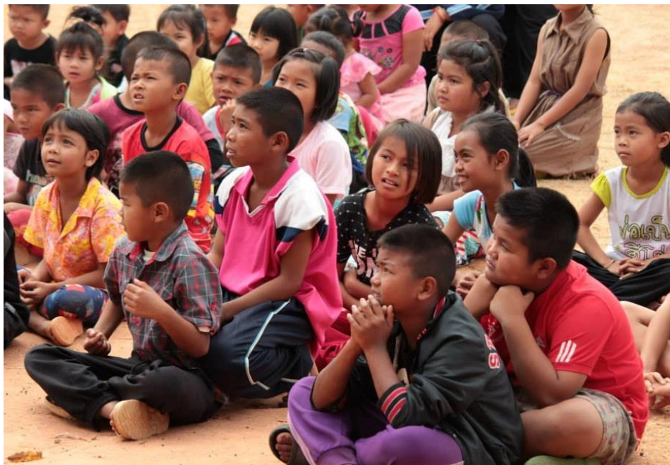
Children living in the Northeastern mountain of Thailand