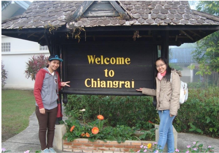
Field trip to Chiangrai with teachers and under-graduated students