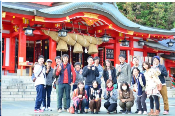
Visiting Shimonosheki and Tsuwano with Japanese students