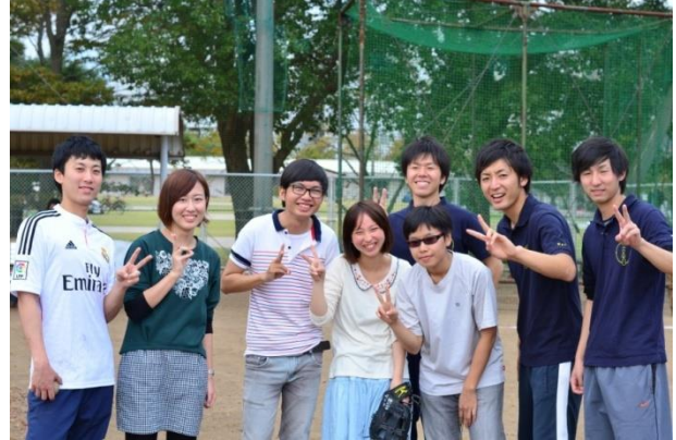
Attending Welcom party and basketball competition with international students