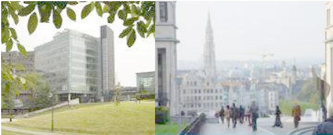
Campus of Vrije Universiteit Brussel